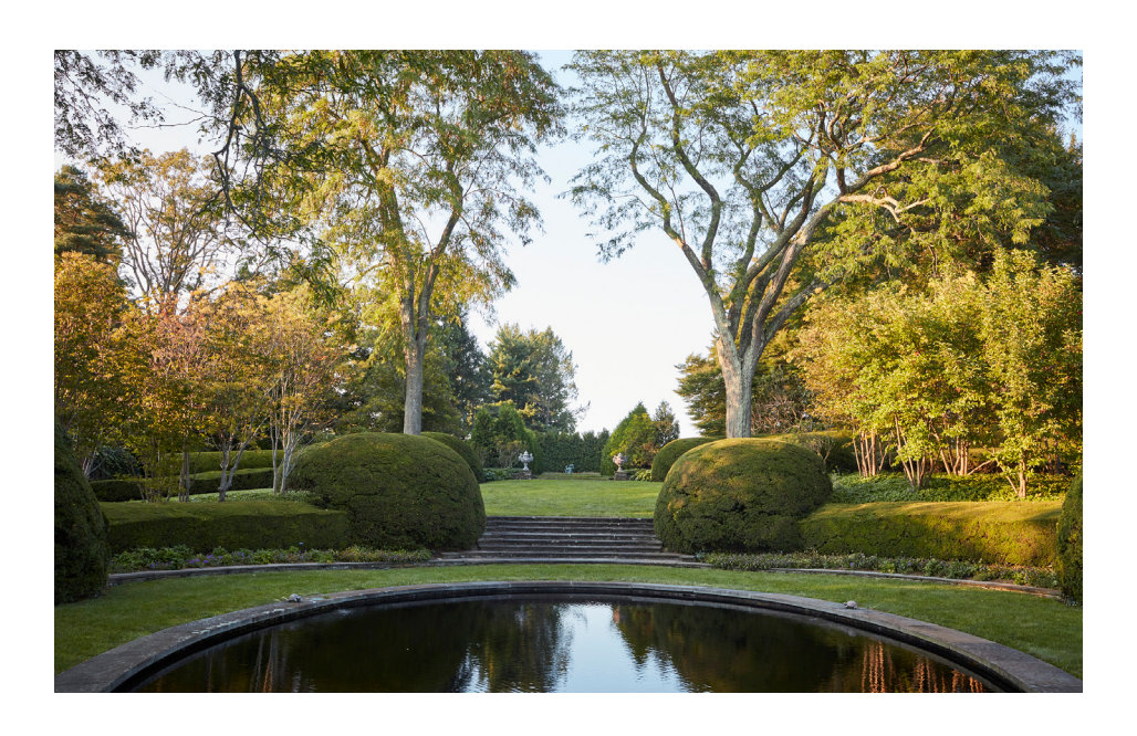
Classicism · Conservation & Horticulture · Cultural Arts · Community