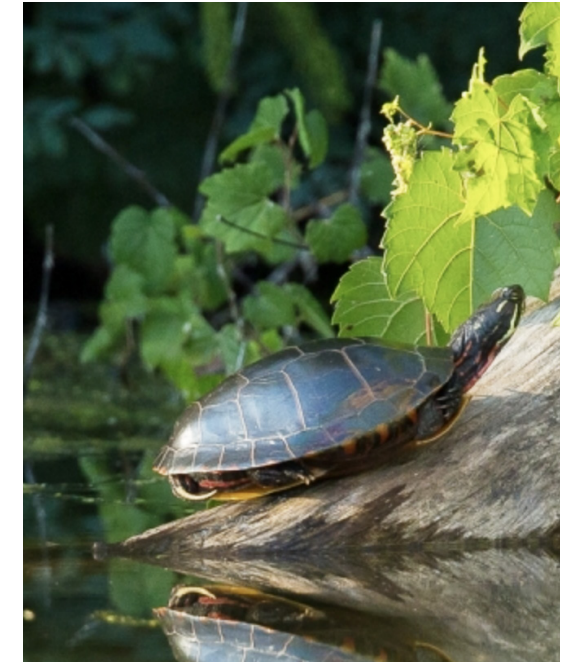
Painted turtle basking in the sun