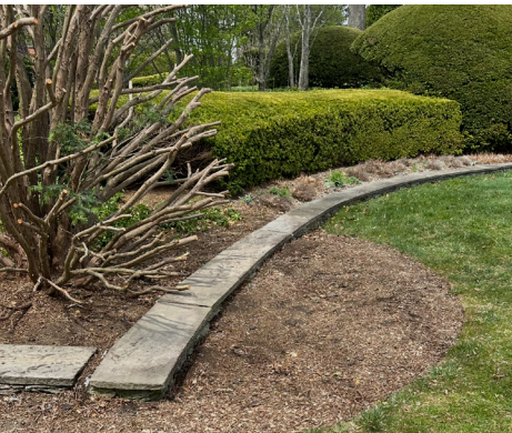
Returning the Garden to its original scale Hard cut-backs in the garden to its original, historic scale better reveal the majesty of Evelyn Poebler’s architectural landscape design. With certain yews cut back as much as five feet (above), visitors can now revel in the poetry of the garden’s architecture features.