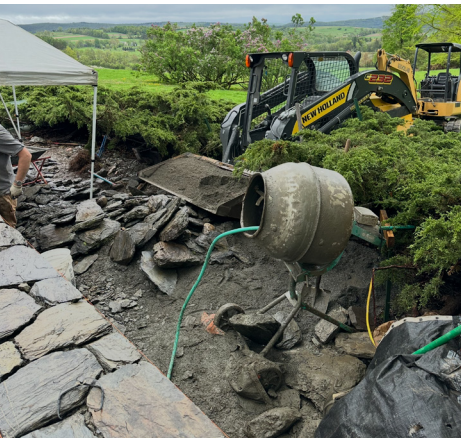
South Retaining Wall The south wall, located below the Citrus Lawn, had developed a significant crack that compromised its entire structure. In 2025, the wall was carefully dismantled, repaired, and refaced with new fieldstone, restoring it to its original design.