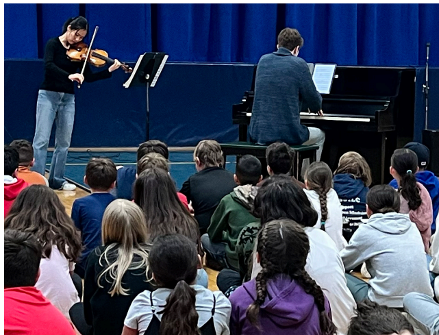
YCA Artists perform for fourth and fifth graders at the primary school in Pine Plains

Throughout the summer, the Adventurers Club returned and young explorers discovered many corners of the estate – from ponds and trails to statues and the cutting garden – through hands-on learning activities and crafts.