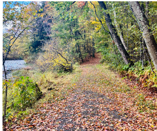
Wethersfield trail around Long Pond