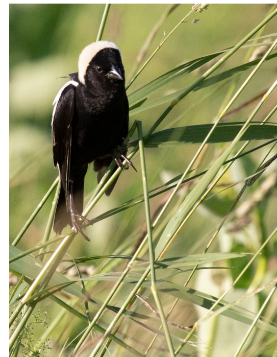
Preserving nesting grounds for the Bobolinks, a tipping point species