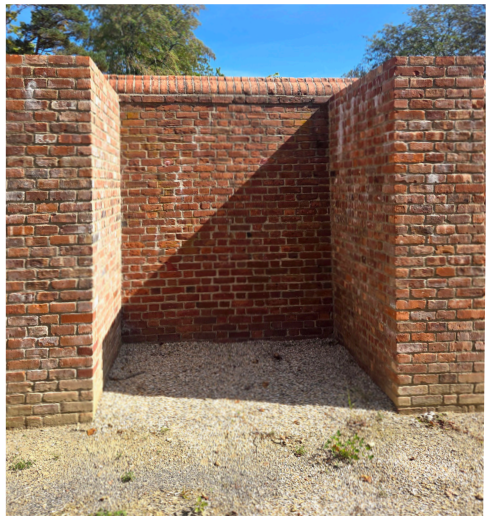
The western wall of the Inner Garden This wall has been re-braced with buttresses for stability and visitor safety, after tree roots had undermined its foundation. This area is now reopened to the public, and is graced with overhead grapevines for shaded seating, punctuated with hanging baskets of bright fuchsia.