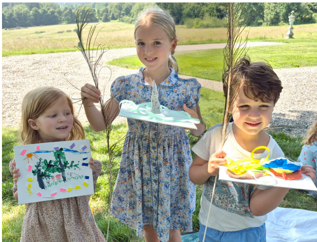
Wethersfield Adventurers sharing their crafts projects