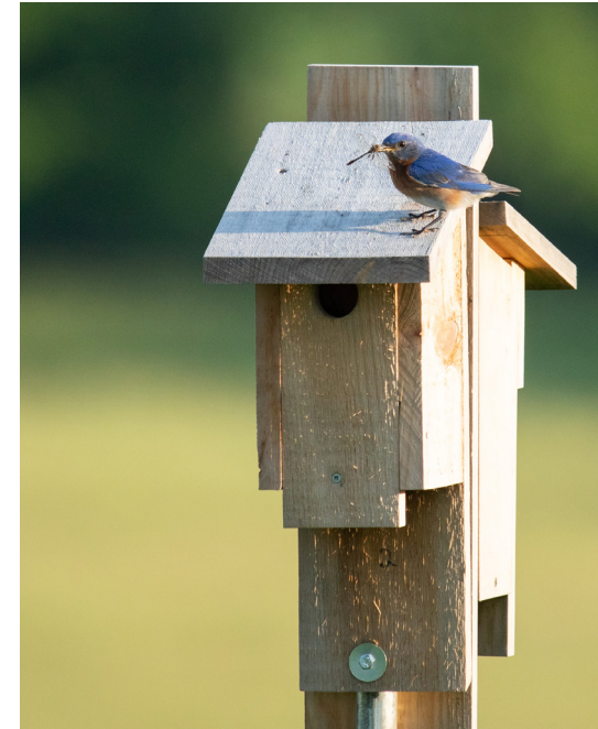
Nesting boxes installed throughout the fields