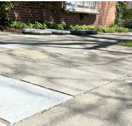
Stone Leveling the Walkways The bluestone pathways throughout the garden and around the house have been properly leveled and placed to ensure safe, even paths and uniform beauty, after suffering years of heaving.