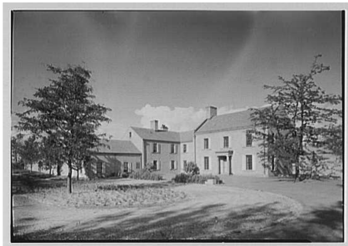
Wethersfield House, 1944