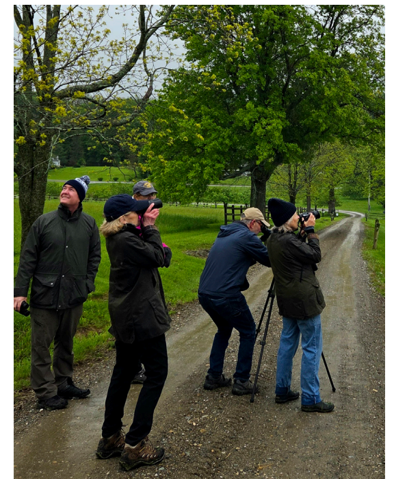
Discovering the rich diversity of birds at Wethersfield