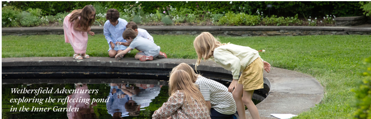
Wethersfield Adventurers exploring the reflecting pond in the Inner Garden