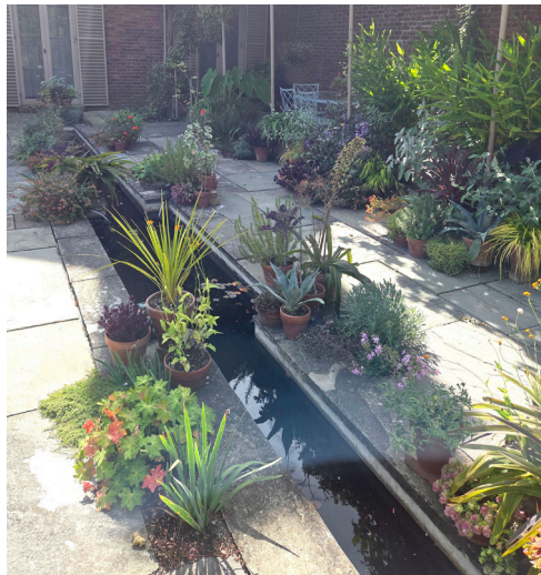
Flowing Through Time: Restoring the Inner Garden’s Historic Rill The Inner Garden Rill is once again an aesthetic delight. Wethersfield had to remove and re-pour its concrete foundation and repair its broken irrigation system. It is now beautifully replanted, with the lovely sound of gently moving water.