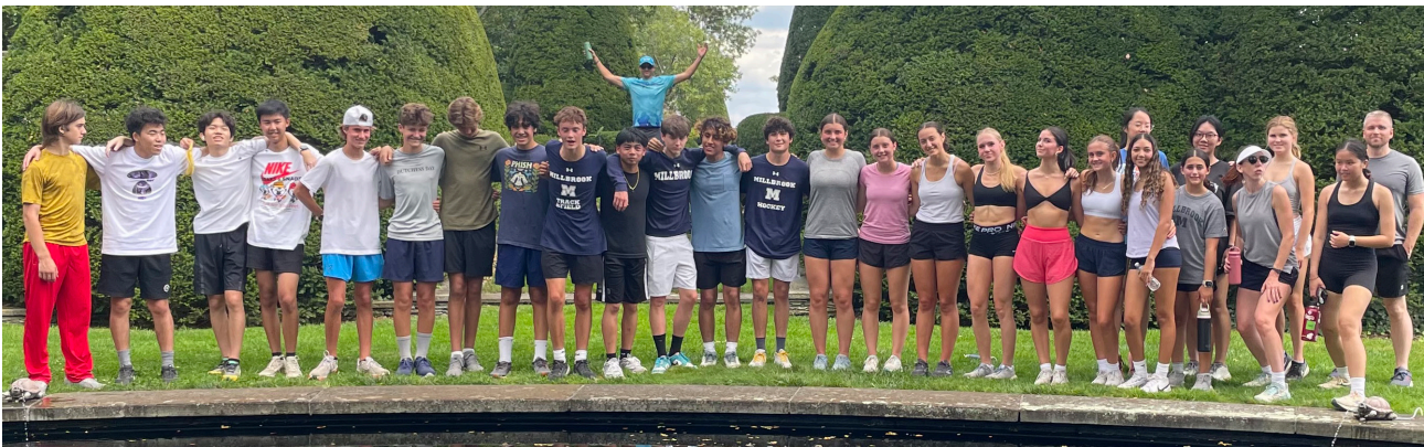
Millbrook School Cross-Country Team on their Annual Run through Wethersfield