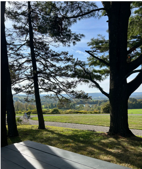
Thinning out invasives To reveal dual vistas of the Berkshires and Taconic Hills from the Pine Grove gardens original architectural features.